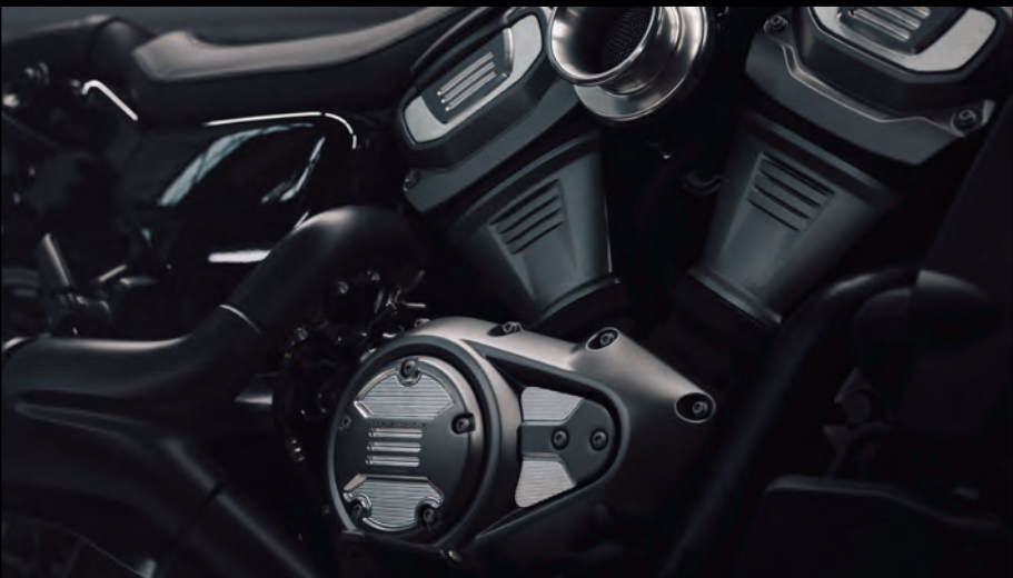
Adversary Collection Engine Trim

Details make this machine extra special. Machined forged billet Adversary™ Collection Engine Trim, Alternator Plug Cover and a raw side-draft Velocity Stack intake. Cover the front axle in style with these smooth custom, die-cast Front Axle Nut Covers. You're ready for your day (or night) on the prowl.