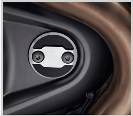
G. WILD ONE COLLECTION – TIMER MEDALLION