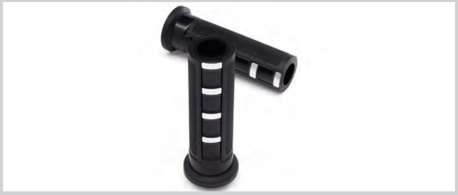
A. WILD ONE COLLECTION – HAND GRIPS

For additional Collections that fit Sport models, see the Engine Trim and Controls sections of this catalog.