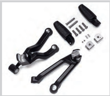
I. PASSENGER FOOTPEG MOUNT & PEG KIT

Machined aluminum highlights.Complete this custom look with additional accessories from the Wild One™ Collection.