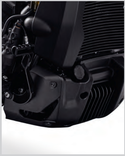
B. CHIN GUARD