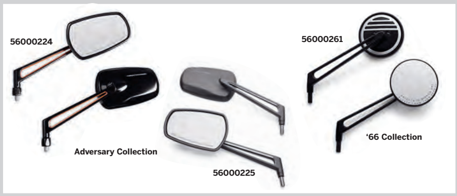
B. ADVERSARY COLLECTION MIRRORS