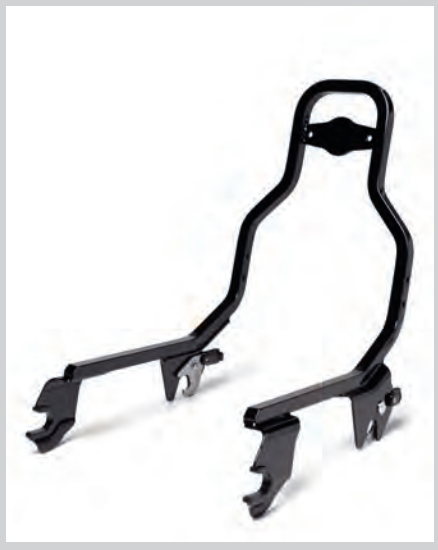
A. HOLDFAST™ SISSY BAR UPRIGHT – LOW HEIGHT – GLOSS BLACK

52300705 Fits '22-later RH975 and RH975S models..