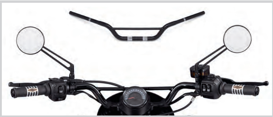
E. TRACKER HANDLEBAR