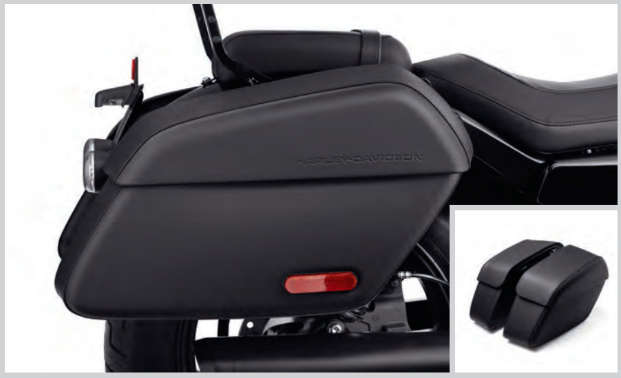
E. DETACHABLE SADDLEBAGS