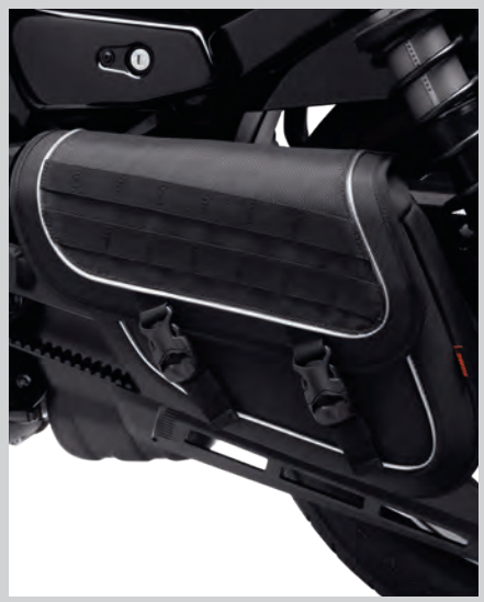
H. SINGLE-SIDED SWINGARM BAGS – MODERN