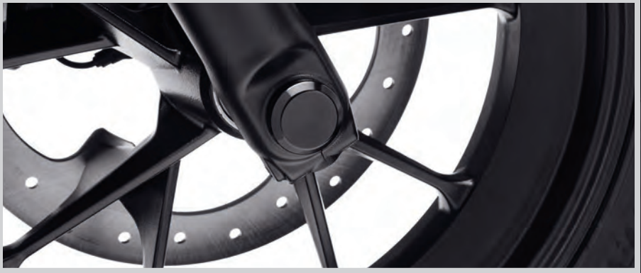
H. FRONT AXLE NUT COVERS – GLOSS BLACK