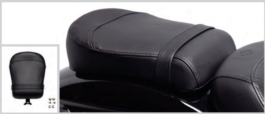
B. SUNDOWNER™ PASSENGER PILLION