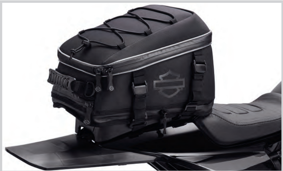
F. TAIL BAG – SPORTSTER S MODEL