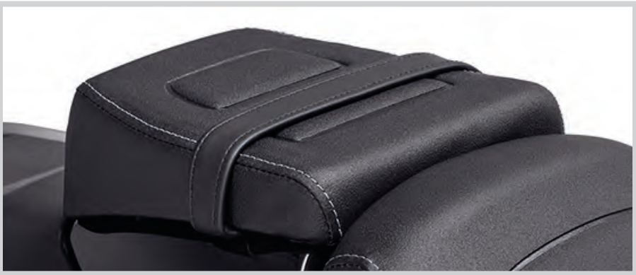
G. PASSENGER PILLION