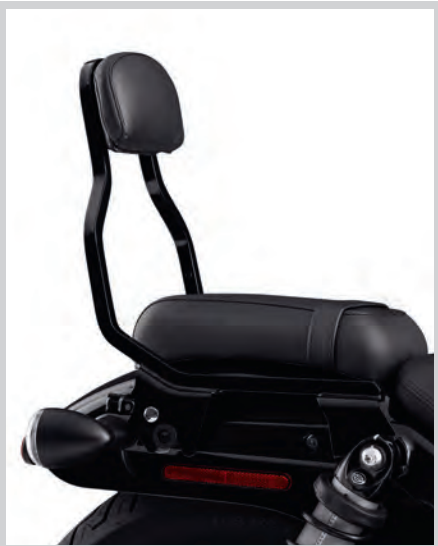
A. HOLDFAST™ SISSY BAR UPRIGHT – LOW HEIGHT – GLOSS BLACK