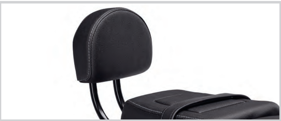
H. PASSENGER BACKREST KIT