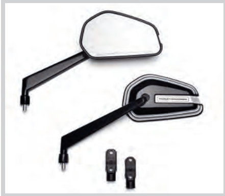
A. EMPIRE™ COLLECTION MIRRORS – BLACK MACHINE CUT