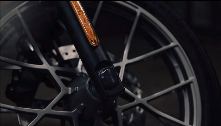
Front Axle Nut Covers