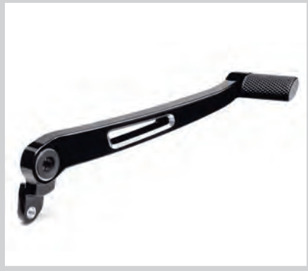
E. WILD ONE COLLECTION – REAR BRAKE LEVER