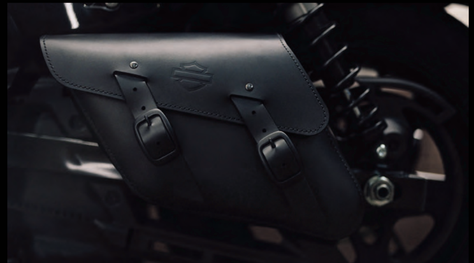
Single-Sided Swingarm Bag - Classic Style