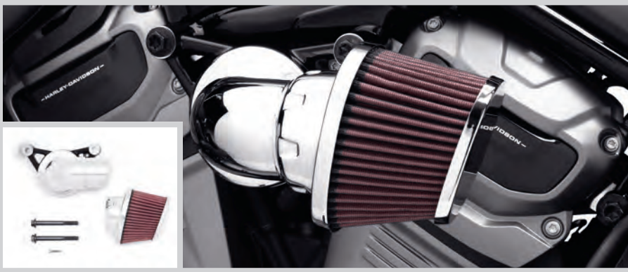
G. HEAVY BREATHER AIR CLEANER – CHROME