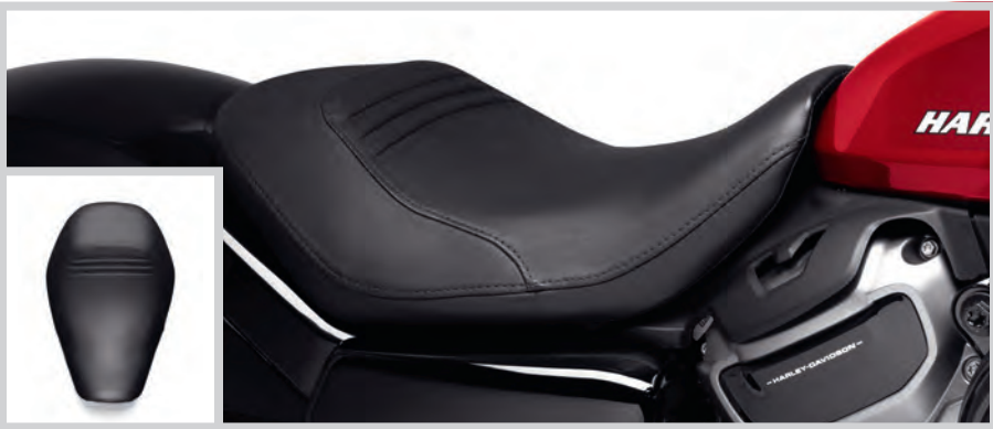
C. REACH® SOLO SEAT