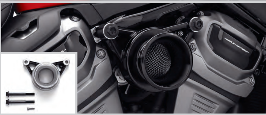
H. VELOCITY STACK – BLACK (RAW SHOWN INSET)