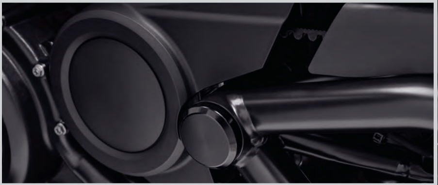
J. SWINGARM PIVOT BOLT COVERS – GLOSS BLACK