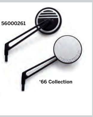
C. '66 COLLECTION MIRRORS