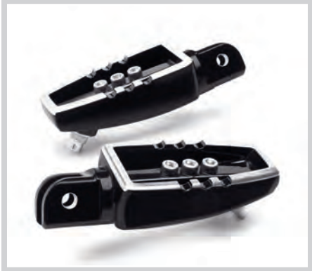
C. WILD ONE COLLECTION – RIDER FOOTPEGS