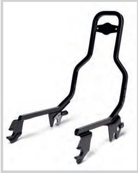
B. HOLDFAST™ SISSY BAR UPRIGHT – STANDARD HEIGHT – GLOSS BLACK