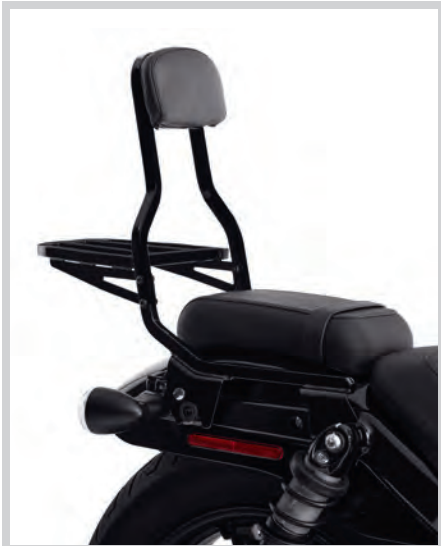
B. HOLDFAST™ SISSY BAR UPRIGHT – STANDARD HEIGHT – GLOSS BLACK