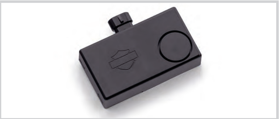
K. SECURITY SIREN KIT