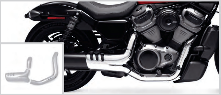
F. CHROME EXHAUST SHIELDS