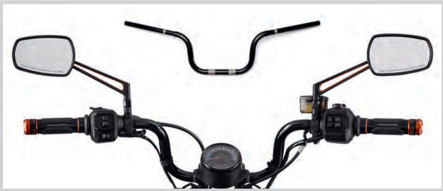
D. REACH® HANDLEBAR