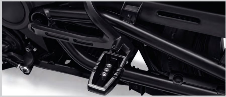
H. PASSENGER FOOTPEG MOUNT KIT ( SHOWN WITH PASSENGER FOOTPEG P/N 50502026)