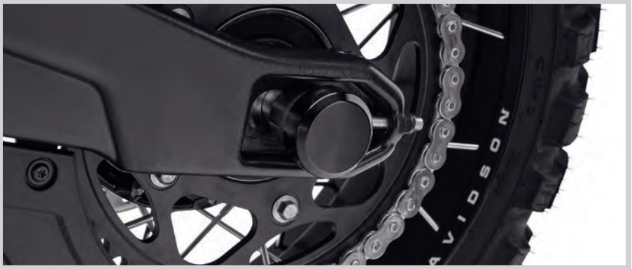
I. REAR AXLE NUT COVERS – GLOSS BLACK