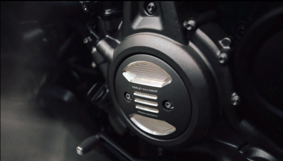
Adversary Collection Alternator Plug Cover