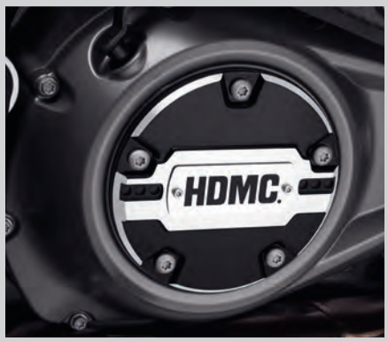
F. WILD ONE COLLECTION – CLUTCH MEDALLION