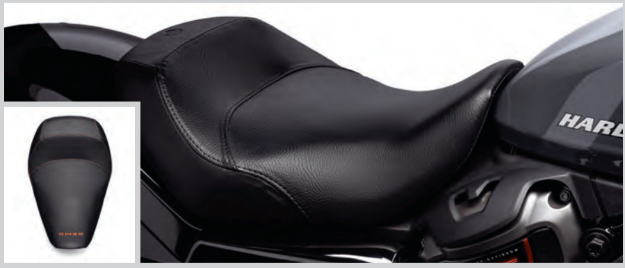
A. SUNDOWNER™ SOLO RIDER SEAT

52400306 Fits '22-later RH975 models equipped with Original Equipment solo seat. Installation requires separate purchase of Passenger Footpeg Mount and Peg Kit P/N 50502434.