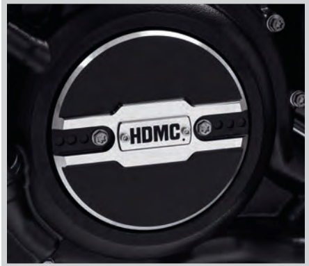
E. WILD ONE COLLECTION – ALTERNATOR PLUG COVER