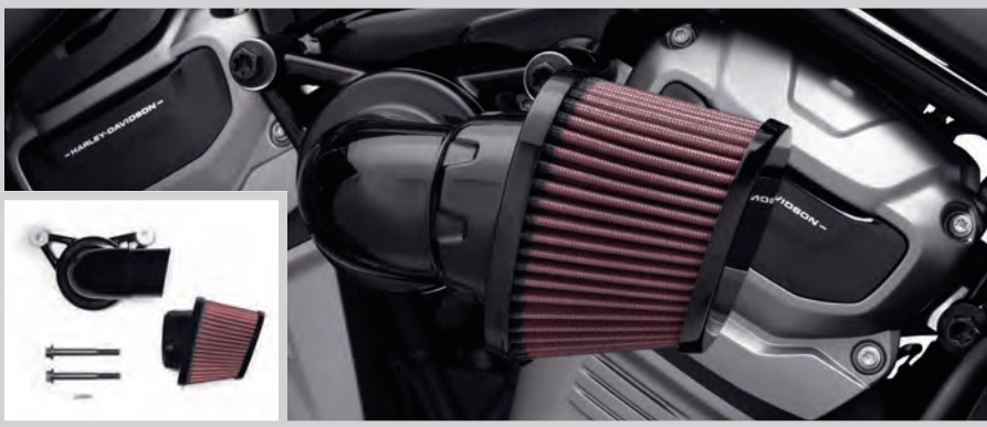
G. HEAVY BREATHER AIR CLEANER – BLACK