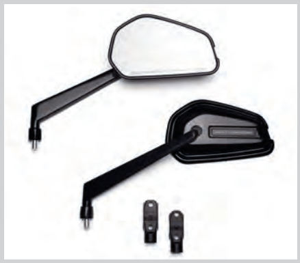
A. EMPIRE™ COLLECTION MIRRORS – BLACK

For additional Collections that fit Sport models, see the Engine Trim and Controls sections of this catalog.