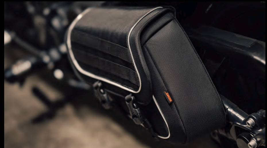
Single-Sided Swingarm Bag - Modern Style