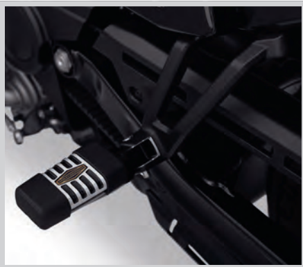
I. PASSENGER FOOTPEG MOUNT & PEG KIT