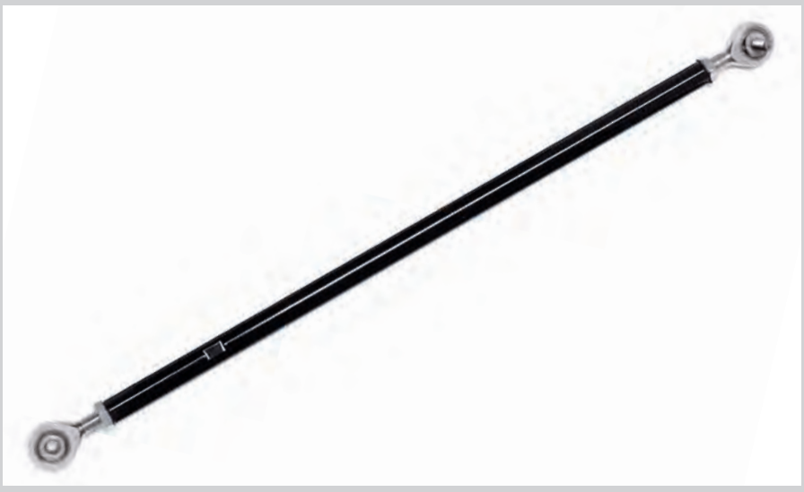
D. BLACK SHIFT LINKAGES