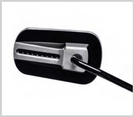
B. WILD ONE COLLECTION – MIRRORS