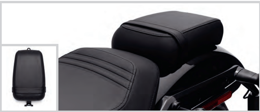
D. PASSENGER PILLION