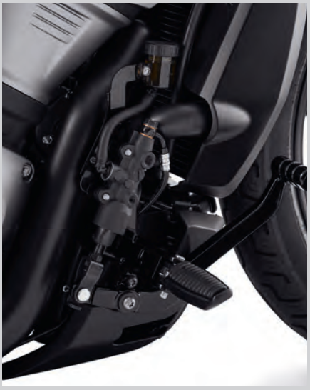
A. FORWARD CONTROL KIT – GLOSS BLACK

33600402 Fits '21-Later RH1250S models with original equipment forward controls.