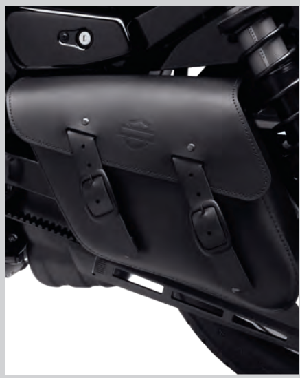
G. SINGLE-SIDED SWINGARM BAGS – CLASSIC