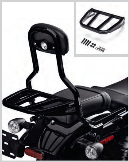
C. LUGGAGE RACK FOR HOLDFAST™ SISSYBAR UPRIGHT – GLOSS BLACK