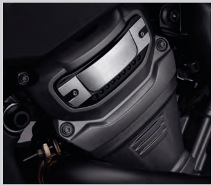
D. WILD ONE COLLECTION – CAM SPROCKET MEDALLIONS