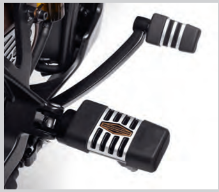
G. '66 COLLECTION – REAR BRAKE LEVER