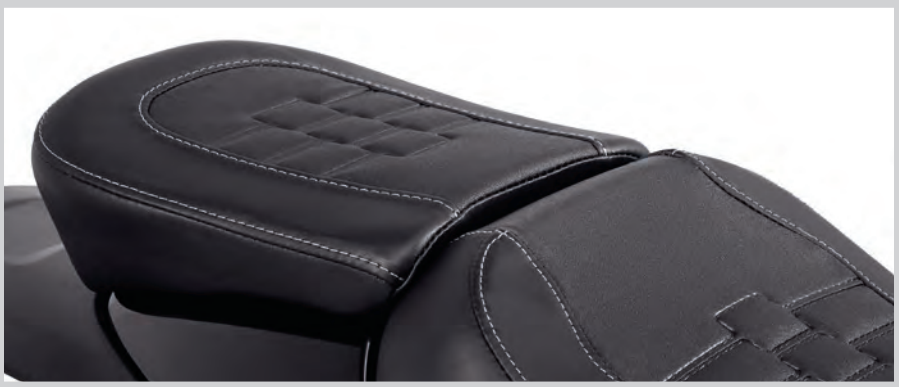
F. SUNDOWNER PASSENGER PILLION