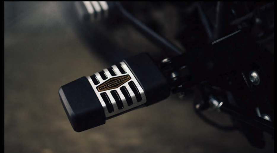
'66 Collection Rider Footpegs