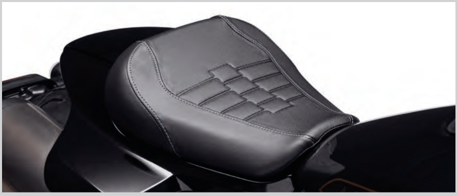
E. SUNDOWNER SOLO SEAT – SPORTSTER S MODEL