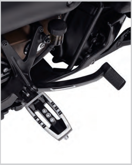
C. MID-CONTROL KIT