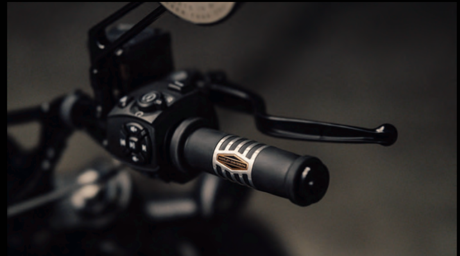
'66 Collection Hand Grips

One for the road. Roll solo and experience enhanced agility on backroads and urban streets with Mid-Controls and a wide Tracker Handlebar. Empty your pockets and stash essentials in our updated Single-Sided Swingarm Bag. '66 Collection Footpegs, Hand Grips and Cam Sprocket Medallions add undeniable style.