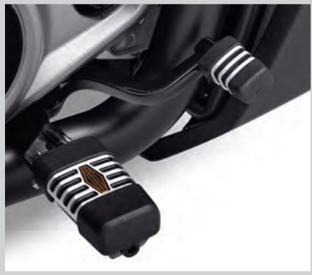
G. '66 COLLECTION – REAR BRAKE LEVER